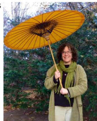
Look for the yellow parasol on Sunday at the Global Climate March Boston!