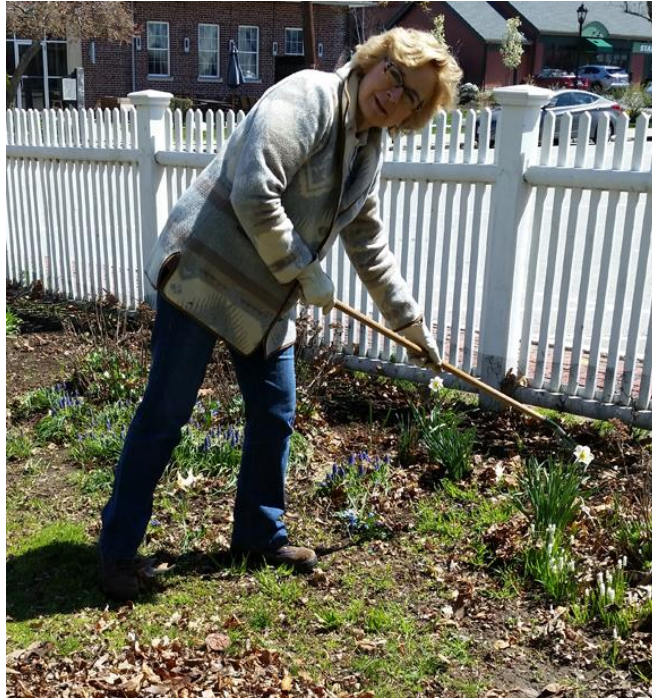
Earth Day – April 23