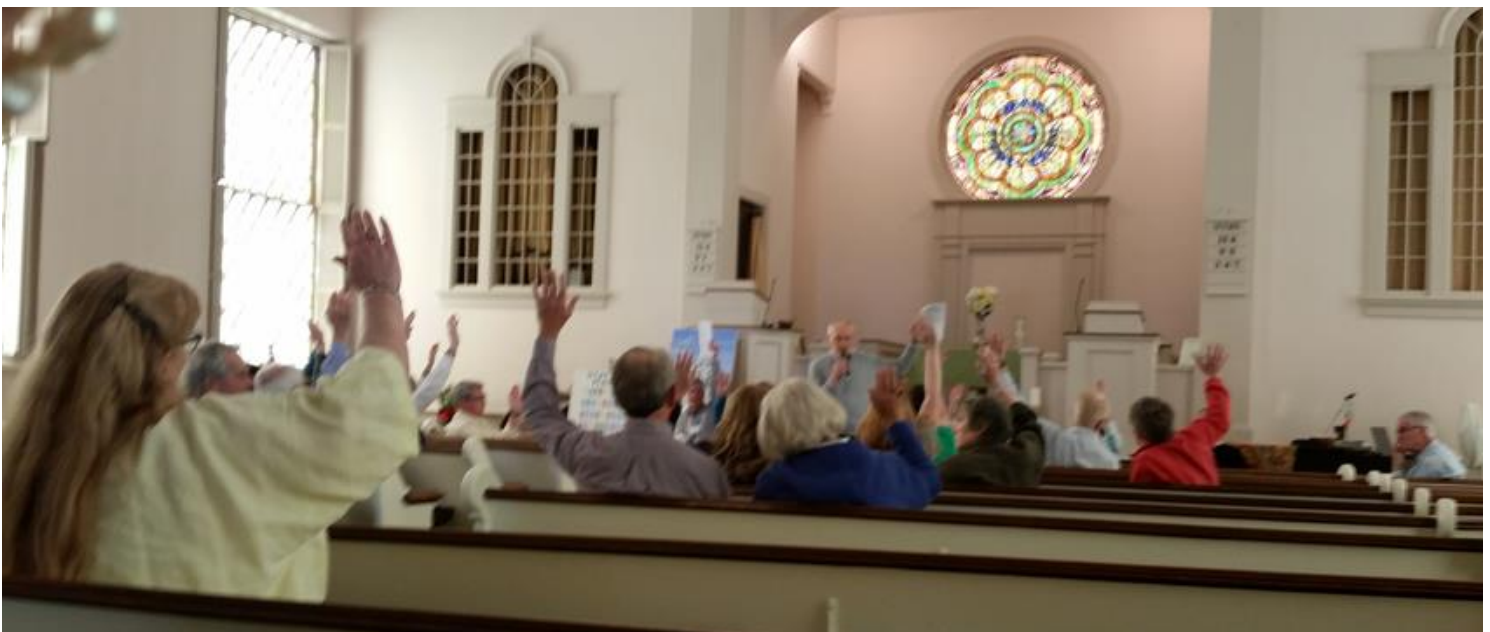
Annual Meeting – May 21