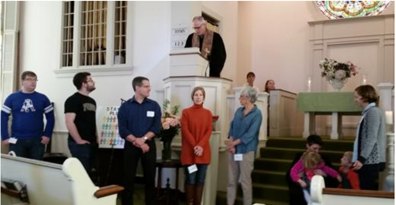
New Member Sunday – April 30th