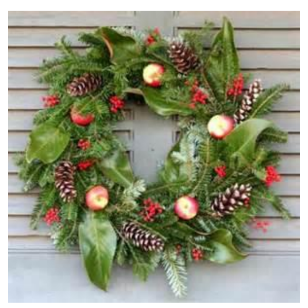
Saturday, December 2rd 10 a.m. until noon

Christmas wreaths, swags, kissing balls, basket arrangements, centerpieces, cemetery memorials, and the Garden Club's well-known miniature boxwood trees will all be available for sale. This is the Club's primary fundraiser and the proceeds support the Club's efforts to beautify the town, including the 19 roadside gardens.