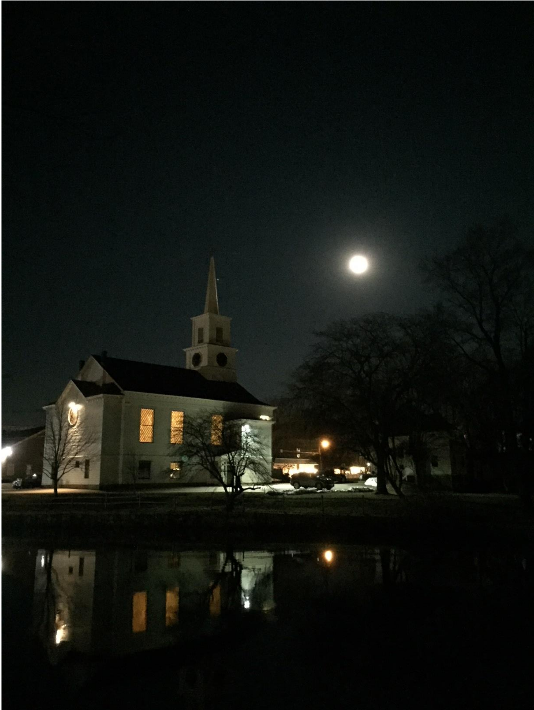
"Spring Moon. First Parish, Medfield, MA."