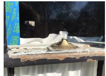
2 Vestry window before amateur-but-adequate repair and paint in 2021

All windows in the Meeting House/Church are single pane and double-hung. Although they are quite old, none of them are original to the 1789 building! First Parish has implemented window replacement in the past, but this was way before anyone's current memory. Options are being explored