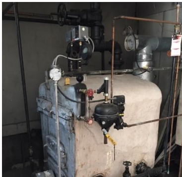
1 The ancient one

As the consequences of climate change affect us more and more near and far, and as our 241-year-old Meeting House endures continued wear, your Green Sanctuary Committee and Building & Grounds Committee are working together even more closely. Necessary building repairs and maintenance have energy usage and efficiency factors to consider. Our mutual goal is to lessen our impact on the environment and decrease how we contribute to climate change—commonly known as reducing one's carbon footprint.