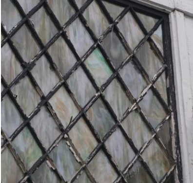
3 Close up of sanctuary window from outside; photo credit David Temple