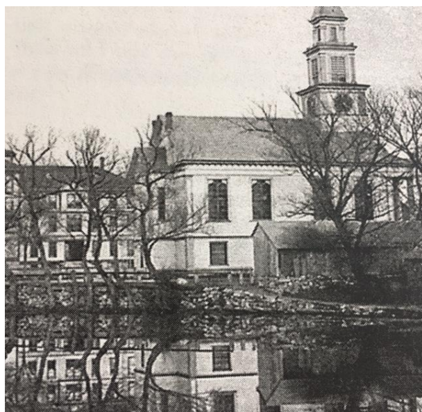
2 First Parish at "the turn of the century"

The original sanctuary windows are evident in a couple of old photos, but just barely. It is difficult to tell if it was clear glass but it likely was. We do not know why the windows were replaced with shimmering opalescent glass pieces. Were the original windows in disrepair, or was it a question of decorative style?