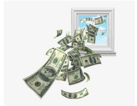
Figure 1 We want to stop this!

Last month, Executive Board members voted to go ahead with the purchase of removable acrylic interior window inserts for the vestry (social hall) windows. They will be custom made by Pioneer Glass of Whitinsville, MA. Final measurements are expected to be done by the time this newsletter goes out. These inserts will add an affordable additional layer to the current single-pane glass windows and save around 20% on what it costs to heat the vestry. This decision was reached through collaborative efforts of several members of the Green Sanctuary Committee, Building & Grounds Committee, and the Board.