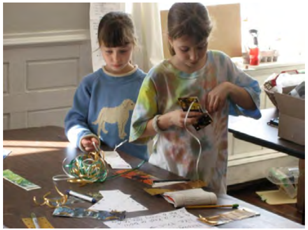
Making bookmarks for the recipients of the HUUGS boxes

Kindergartners through 6^{th} graders once again explored the many sides of peace and peacemaking this past January and February. As many of you noticed, we had a peace building center going on every Sunday, as well as a -tiled" peace wall. We expanded our economic and social justice learning to include fair trade bananas , along with the now usual fair trade chocolate. We wrote a letter to Shaw's and Roche Bros. Supermarkets asking that they consider selling fair trade bananas, just as they now offer fair trade chocolate, cocoa, coffee, and tea.