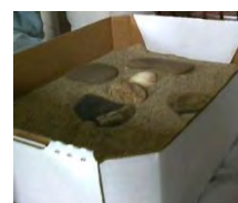
Making Zen sand gardens