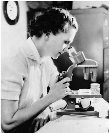
Rachel Carson, Scientist

Forty days brings us to May 27 . This happens to be the birthday of Rachel Carson, the scientist whose work prompted the beginning of what we know as the environmental movement. I think it would be very cool to get together on May 27 and share some food and stories about what our commitment has been like. If anyone would like to help me plan this event, let me know.