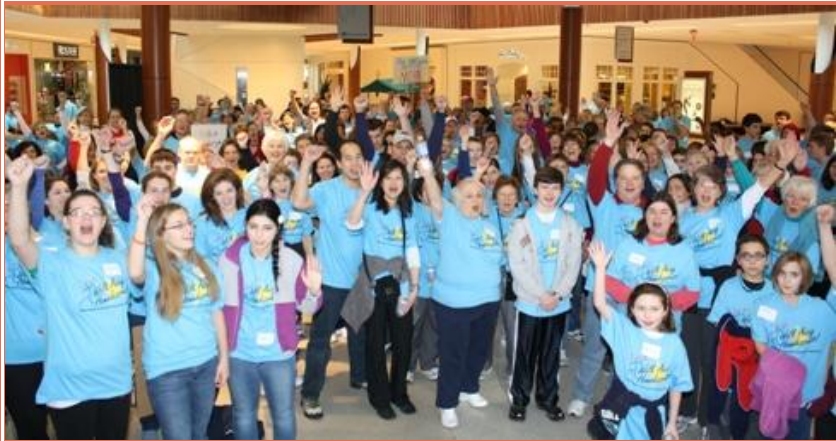
2012 Family Promise Metrowest Walkers!

Family Promise Metrowest's 4th Annual Walk Away Homelessness Event!