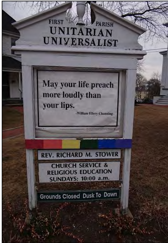
Our Wayside Pulpit – Removed from Grounds in September 2013 (Photo Taken on 02/15/12)

The Sign Committee reports that we have secured the following: