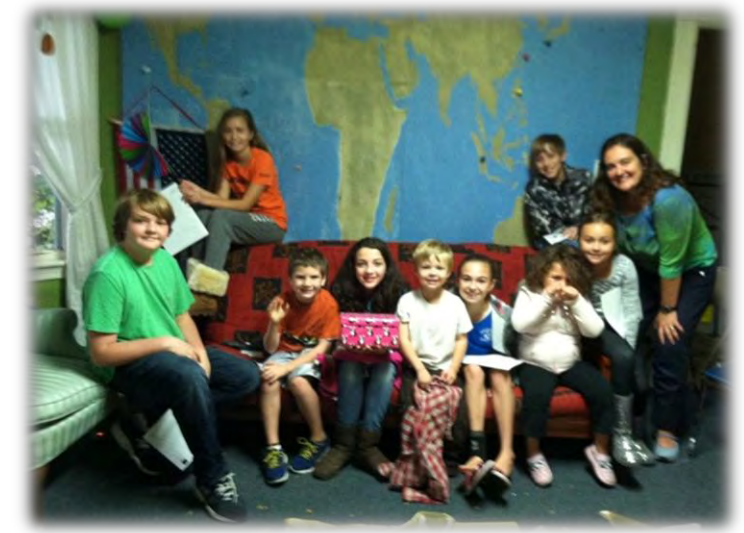
Religious Education collected money at Medfield Day to give to the Medfield Animal Shelter. This is the photo the Shelter took of us when we presented the gift.