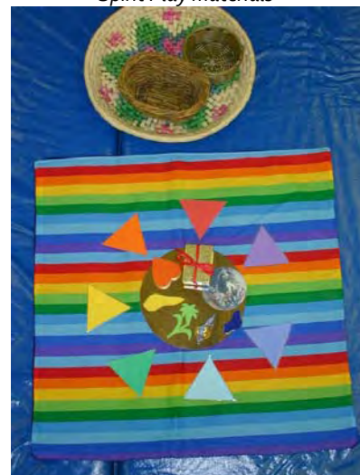
Spirit Play materials

Two adults facilitate Spirit Play each week, the "storyteller" and the "doorkeeper." The storyteller conveys the story or lesson (following a script, and learning it as much ahead of time as possible), and the doorkeeper welcomes kids into the space and helps set and maintain the tone throughout the class. If you might like (or be willing to) play the role of storyteller or doorkeeper at some point during this church year, please come to the orientation below. We'll go over some basic policies and procedures for RE at First Parish.