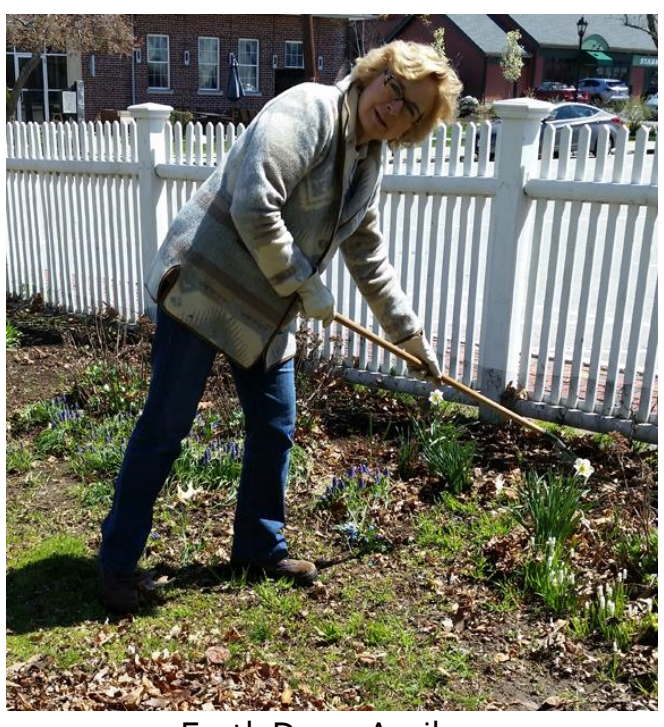
Earth Day - April 23